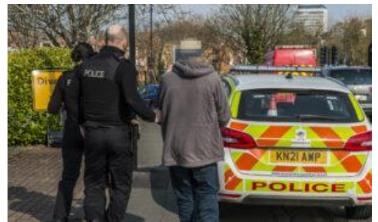
Police drug raids, operation Scorpion 14.3.2022

You can contact the independent charity Crimestoppers 100 per cent anonymously on 0800 555 111 or via their Anonymous Online Form .