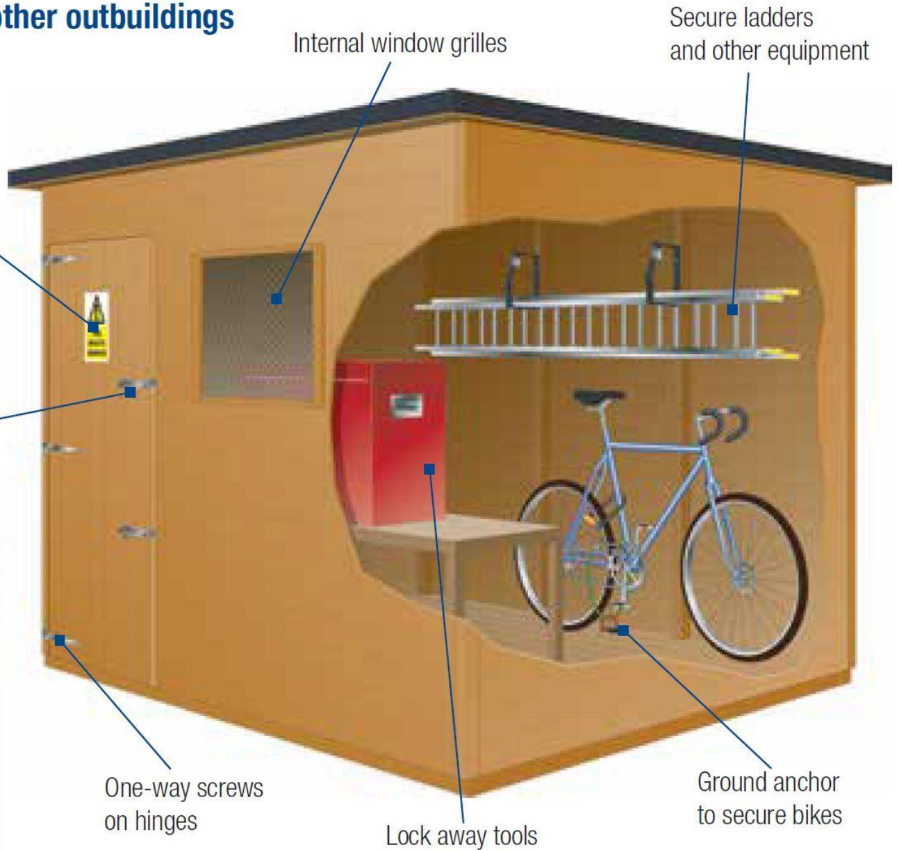
Internal window grilles

Many criminals target sheds and outbuildings to steal tools and they use these tools to break into your home. Ensure that your contents insurance covers the items stored within your garage, shed or outbuildings.