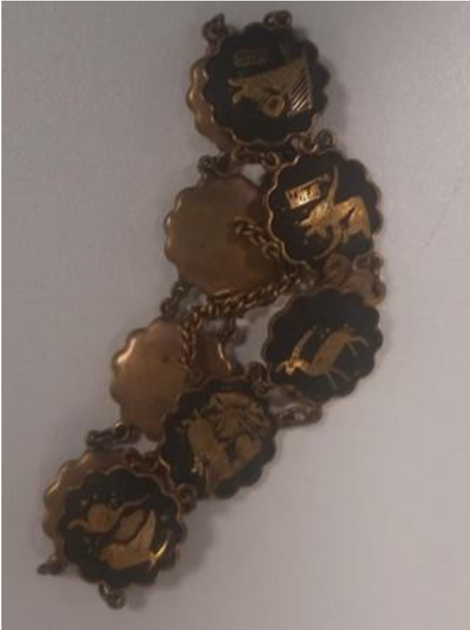
Distinctive bracelet with animal designs

The collection also includes a distinctive black and yellow metal bracelet with individual designs on linked plaques.